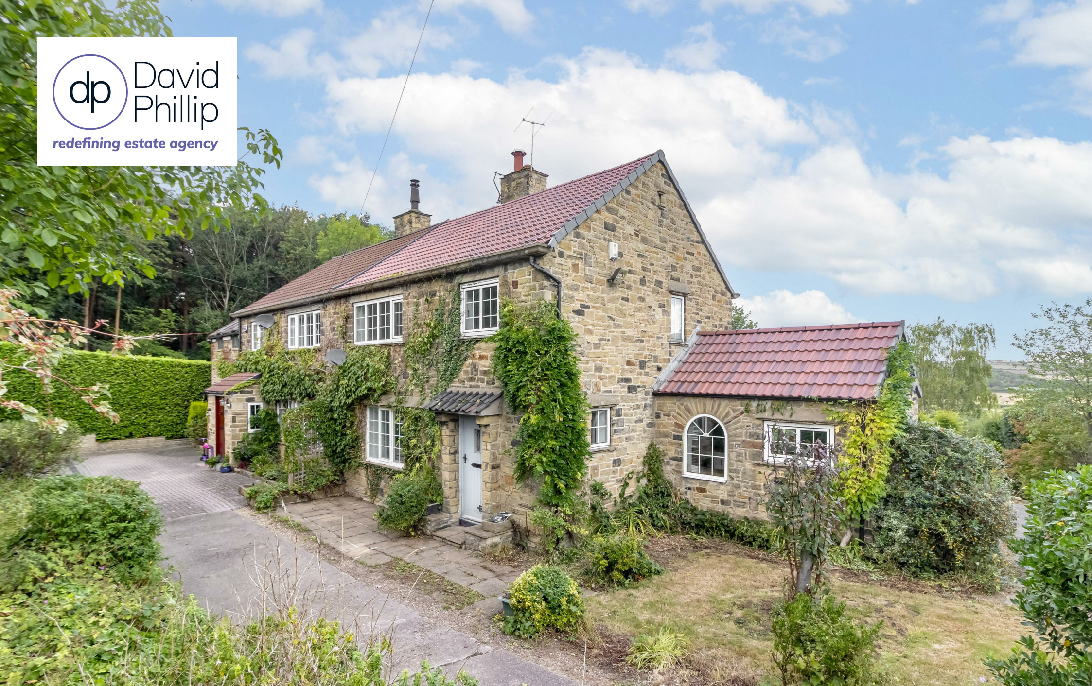
Woodland Cottage, 12 Weardley Lane, Leeds, LS17 9LS Price Guide £625,000